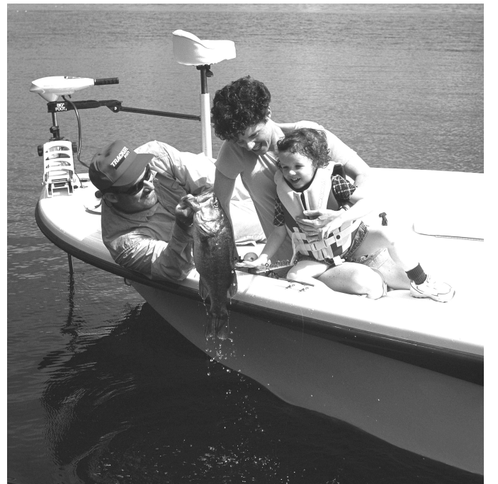
The catch-and-keep bass fishing season has started and there are some great spots for anglers across the state.