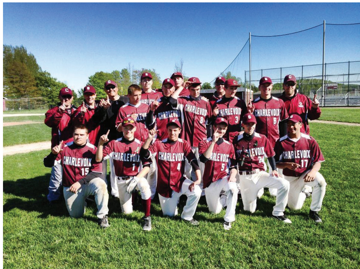
The 2013 Lake Michigan Conference champion Charlevoix Rayder baseball team.

The result; Charlevoix a game one winner, and after leading 6-4 in the bottom of the fifth (suspended due to rain) game two with the Glads up to bat and the bases loaded with two outs. Charlevoix learned the next day