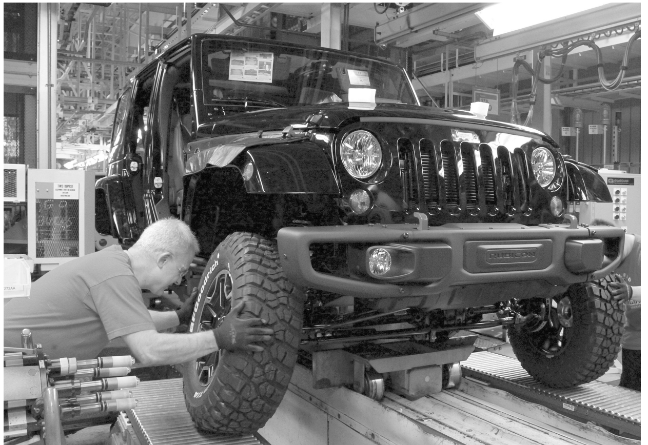
Employees at Chrysler Group's Toledo (Ohio) Assembly Complex configure tires to the one-millionth Jeep Wrangler JK. The 2013 Jeep Wrangler Rubicon 10th Anniversary Edition rolled off the line during a milestone celebration at the Company's facility on May 17, 2013.